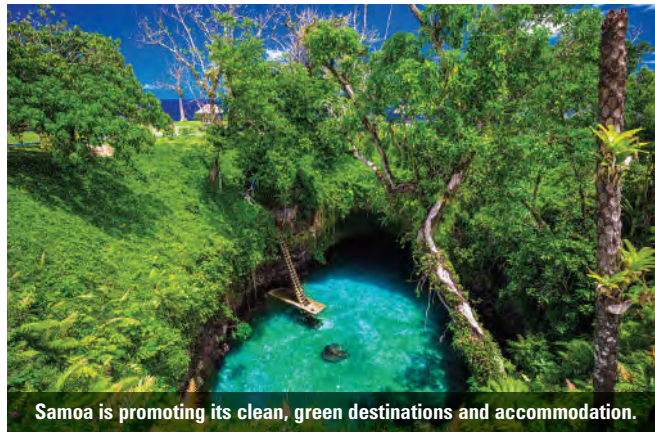
Samoa is promoting its clean, green destinations and accommodation.

Eco-tourism and sustainability have become a massive priority for the South Pacific islands in recent years, with Samoa