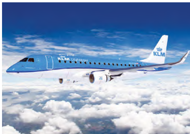
KLM is taking off from Southampton once again.

Air Transat has resumed flights from the UK to Canada, recommencing non-stop flights from three UK airports to Toronto, with services from London