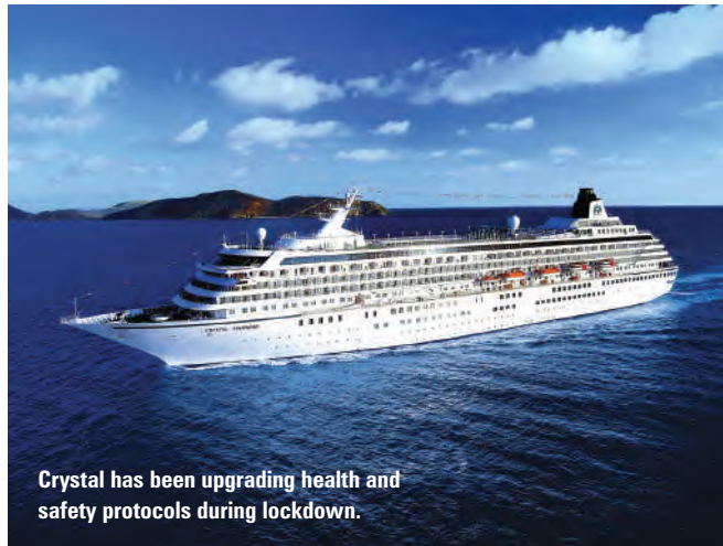
Crystal has been upgrading health and safety protocols during lockdown.

For a limited time, the Crystal Confidence 2.0 programme offers guests 90 days from the time of booking to place their deposit on any of Crystal Symphony's newly released 2023 voyages or any 2020-2023 sailings across all brand experiences – Crystal Cruises, Crystal River Cruises, Crystal Yacht