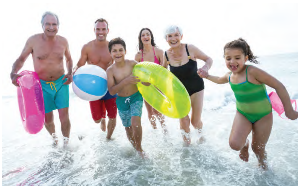
Plenty of families are seeking to make up for lost time with multi-generation holidays.

Thanks to the lockdown, many Brits have not been able to spend quality time with their families. Now restrictions are being eased, there are opportunities to sell multi-generation holidays.