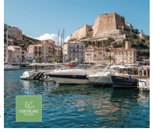
Twin centres combining a stay on each island can be arranged.

The online flip books are full of destination, accommodation, and travel information, along with holiday recommendations for certain types of customers. The tour operators' phone numbers and websites are not shown so that agents can happily forward brochures to their customers.